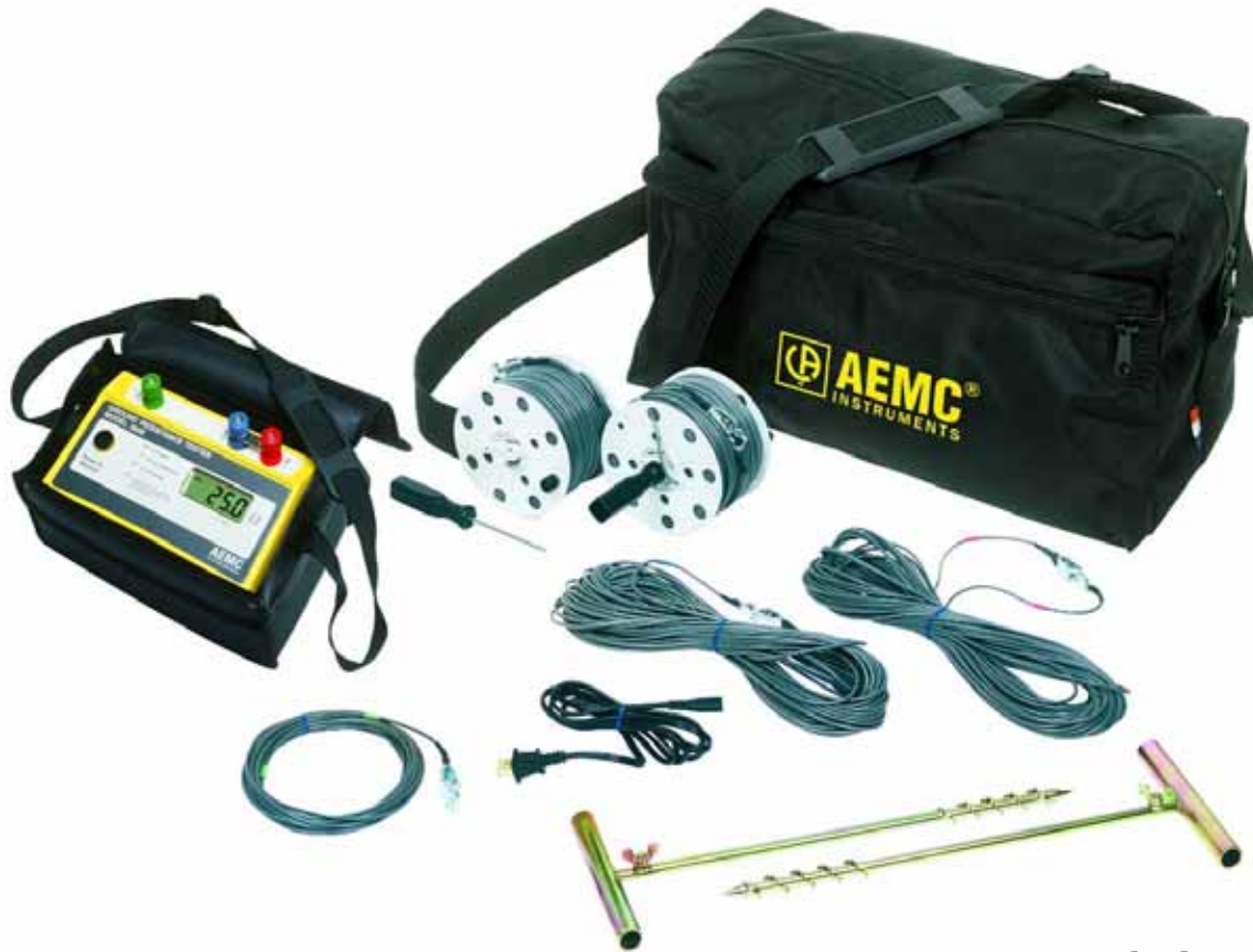
Model 3640 Kit (optional) Catalog #2114.93