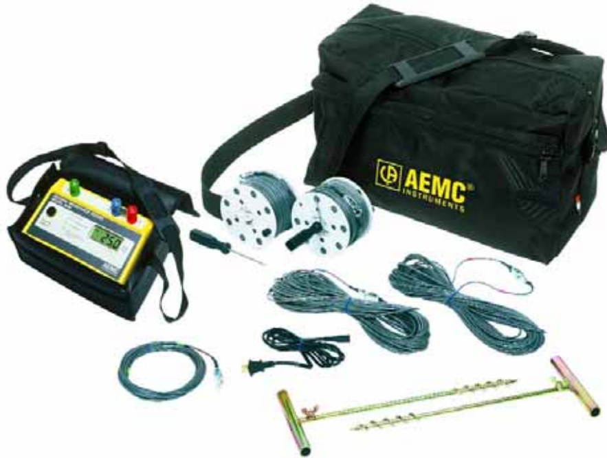
Digital Ground Resistance Tester Model 3640 Kit Catalog #2114.93