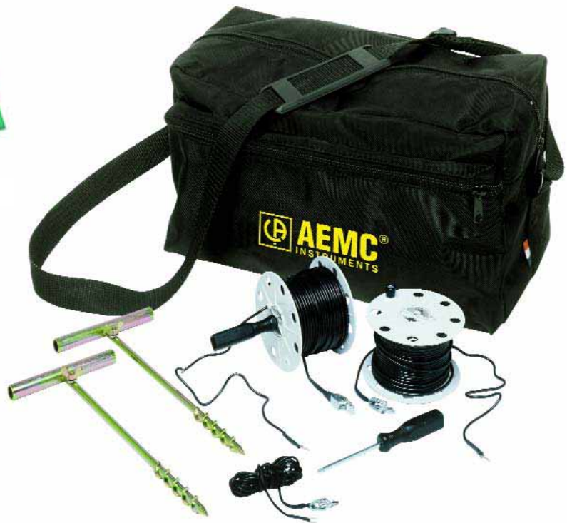
Test Kit for Model 3640 includes one 16 ft lead, two 150 ft leads on spools, two wind-up handles, two auxiliary ground electrodes and molded hard carrying case with slot for meter Catalog #2114.96