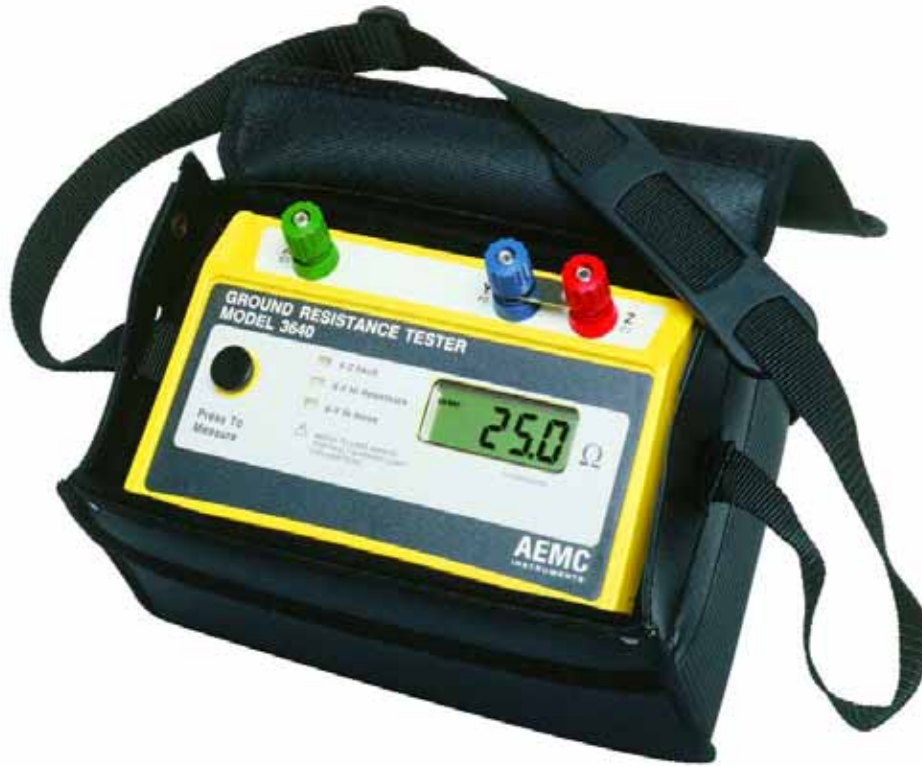
Model 3640 shown in standard soft carrying case Catalog #2114.92