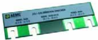
25Ω Calibration Checker Catalog #2118.58