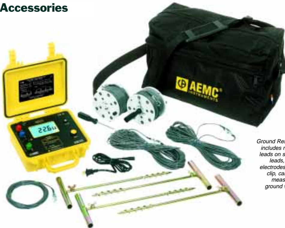
Ground Resistance Tester Model 4630 Kit includes meter, two 300 ft color-coded leads on spools, two 100 ft color-coded leads, four 16" auxiliary ground electrodes, one 16 ft lead with Mueller® clip, carrying bag, one 100 ft tape measure, one AC power cord, ground workbook and user manual