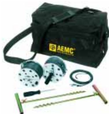
Test Kit – 3-Point includes carrying bag, two 150 ft color-coded leads on spools, two 16" auxiliary ground electrodes, one 16 ft lead with Mueller® clip and one 100 ft tape measure Catalog #2130.62