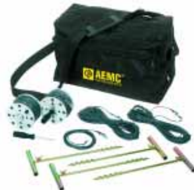
Test Kit – 4-Point includes carrying bag, two 300 ft color-coded leads on spools, two 100 ft color-coded leads, four 16" auxiliary ground electrodes, one 16 ft lead with Mueller® clip and one 100 ft tape measure Catalog #2130.63