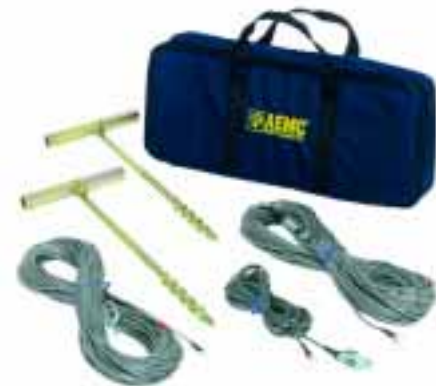
Ground Test Kit – 3-Point (supplemental 4-Point) includes carrying bag, two 100 ft color-coded leads, one 16 ft lead and two 16" auxiliary ground electrodes Catalog #2130.61