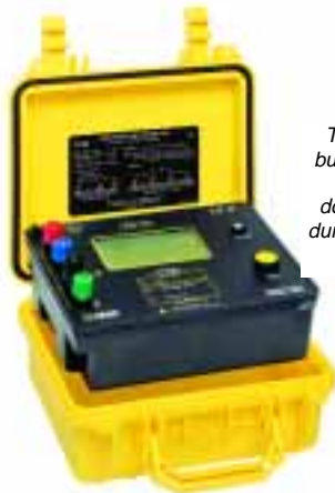
The Models 4620 and 4630 are built into a double case. This extra rugged construction provides double insulation, maximum field durability and ease of serviceability.